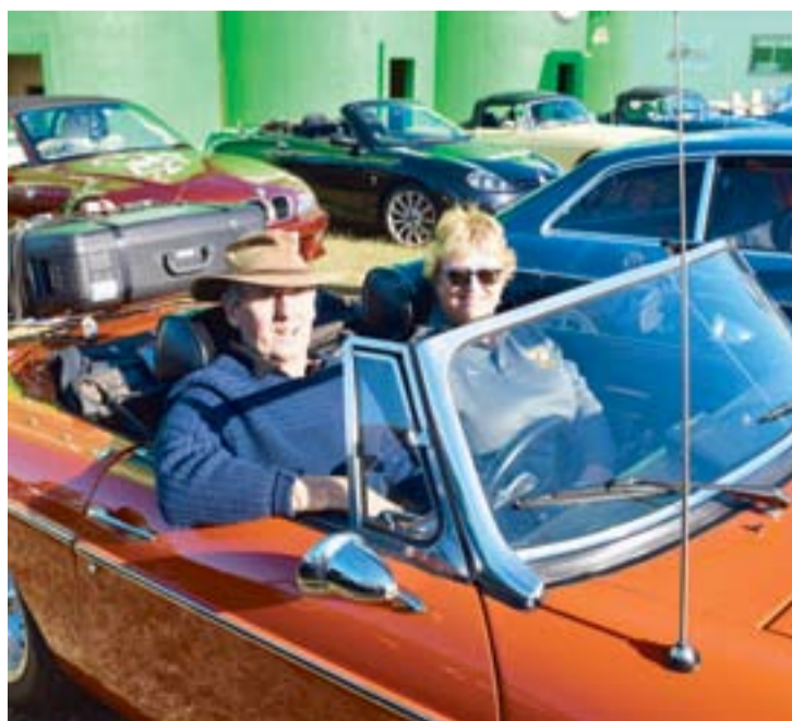
MG Car Club members in their 1973 MG B Convertible.