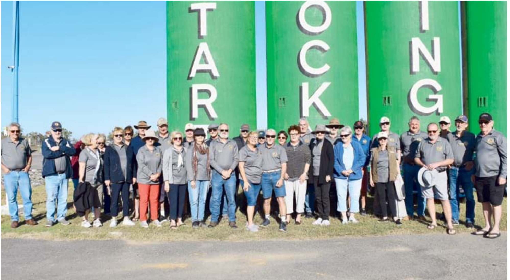
The MG Car Club Capricornia Chapter is the most active in Queensland.