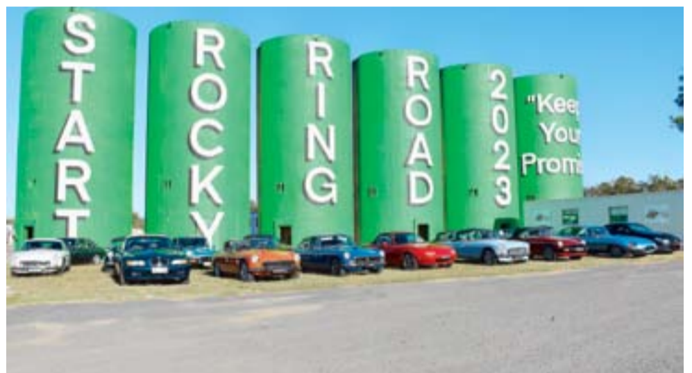
Nineteen cars were making the trip up north.

For more information about the MG Car Club Capricorn Chapter, visit their website at www.mgccq.org.au/capricorn-chapter .